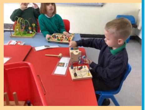
Lara loves to thread the beads over the loops. Kayden's favourite activity is pushing the wooden cylinders through the holes, he even matches the colours independently!