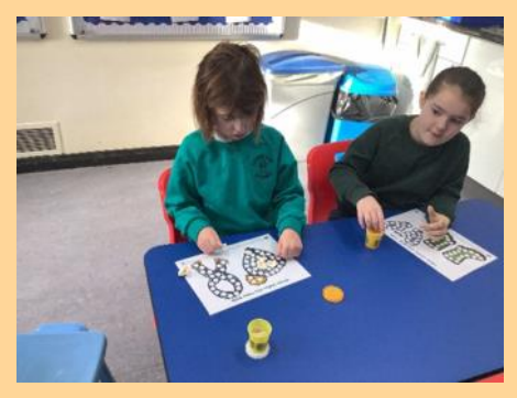
Lexi-Rose uses her pincer grip to pinch and roll playdough

Wrens have been taking part in a new session in class over the past couple of terms to support our readiness for learning and sensory regulation. Every day after circle time we have our Busy Hands session to help us prepare for our snack time. We take part in a variety of activities including playdough, peg boards, wooden puzzle toys and cutting skills. These activities helps us to feel calm, develop our fine motor skills and gives some of us the sensory exploration and feedback we need before using our hands to eat our snacks.